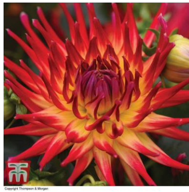
Dahlia 'Maggiore Fire'