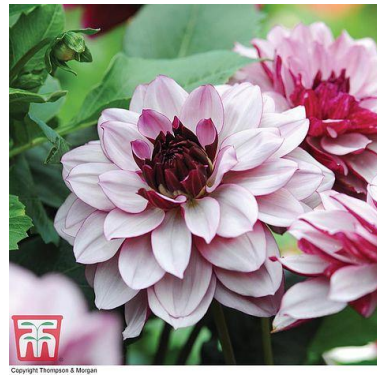
Dahlia 'Creme de Cassis'

I love echinaceas and think this lime green & pink one, 'Green Twister', is fabulous. I am also quite taken with another newcomer, a sweet pea named 'Almost Black' from King's Seeds who are also offering this rather wonderful pink dahlia, 'Maldini', of modest height (28").