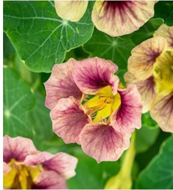
Tropaeolum minus 'Lady Bird Rose'