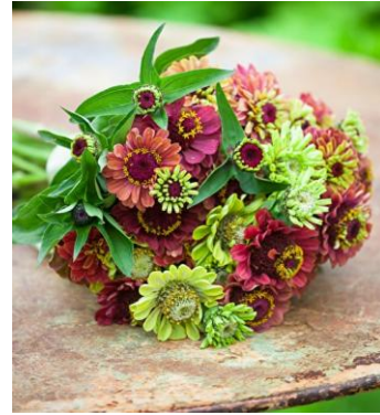
Cranbry & Lime Zinna collection