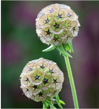
Scabiosa stellata 'Sternkugel'

I love Sarah Raven's website - her choice of plants chimes with my own favourite colour combinations. I came across this stunning scabious, scabiosa stellata 'Sternkuge'. The pink nasturtium is rather lovely too. This zinnia collection echoes the colours of the echinacea above