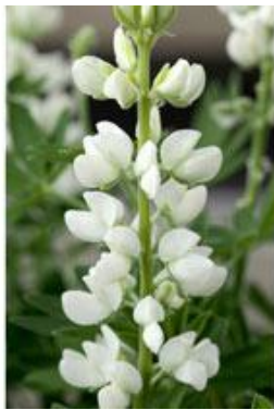
Lupin 'Snow Pixie'

The first two that caught my eye are dwarf forms of popular perennials - verbena bonariensis 'Lollipop', which has all the usual characteristics but is only half as tall, and lupin 'Snow Pixie', a pretty, dwarf & fragrant lupin standing just 12-16" tall (Sutton's Seeds). Meanwhile, Thompson & Morgan have several new introductions including this rather striking dahlia 'Maggiore Fire' or its more subtle introduction, 'Creme de Cassis'.