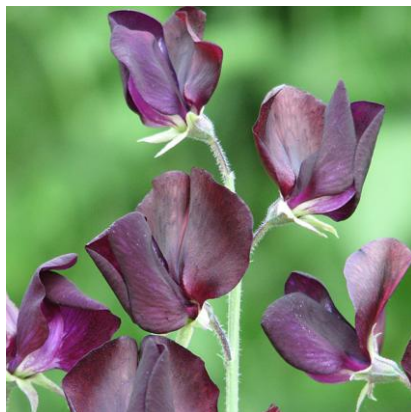
Lathyrus odoratus 'Almost Black'